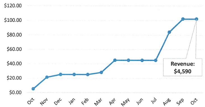
KC Hard Mix (per ton)