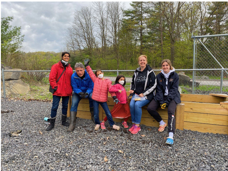
Members of Cornell Cooperative Extension of Ulster County were among our first visitors to the new Home Composting Demonstration Garden (May 7 th 2022). The Recycling Outreach Team partnered with CCEUC for the 4-H Youth Civic Engagement Project. We received support planting native pollinator crop of Milkweed in the new raised garden bed.