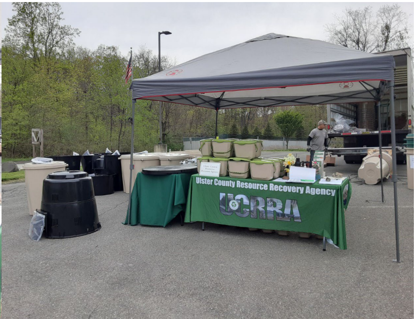
UCRRA's Spring Compost Bin & Rain Barrel Sale (May 7 th 2022) was a success! The store received 90 pre-orders and the Recycling Outreach Team distributed 55 rain barrels, 36 Earth Machine composters, 20 Dual Chamber Tumbling Composters, 3 Vermi-composters, 1 Geobin Composter, and other composting tools. We also distributed 76 educational composting kits to Ulster County participants.