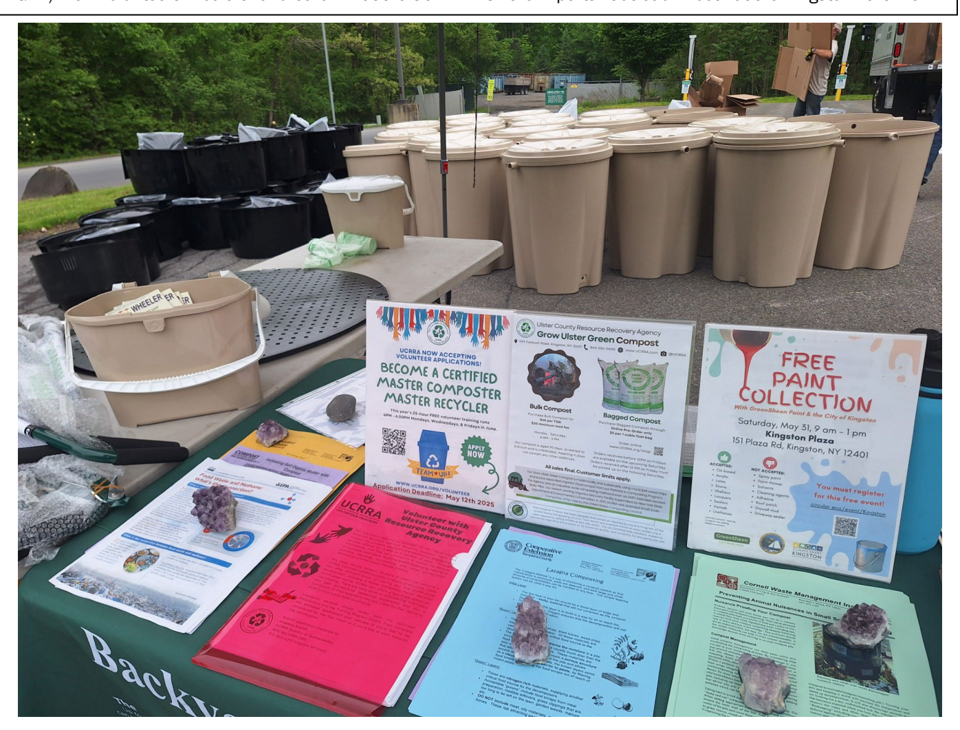
(ABOVE) UCRRA Compost Bin & Rain Barrel Sale on May 17th 2025.